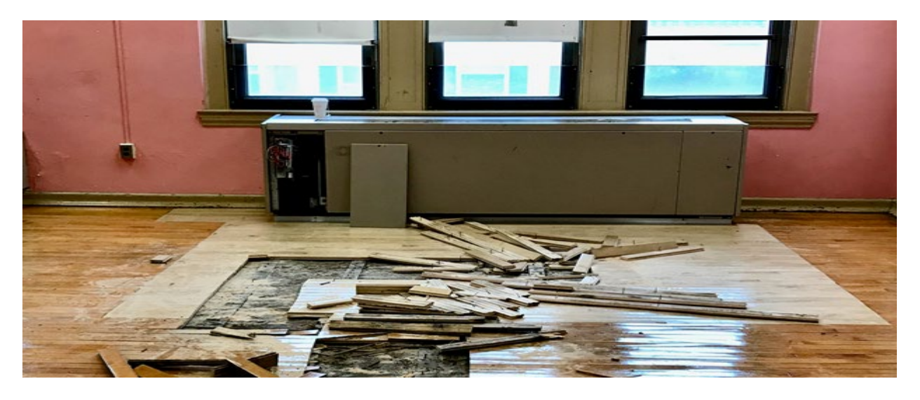
Photo Caption: Repeat flooding from malfunctioning classroom unit ventilator resulting in extensive damage and mold growth to newly installed flooring. The original flooring was replaced for the same reason just a few weeks earlier. An example of what happens if the "root causes" are not addressed.<sup>7i</sup>

The challenges of managing capital planning, financing, design and construction have grown and most districts are small and do not maintain capital planning, budgeting, financing or management capacity in their districts. Even in the large school districts, these functions are typically under-staffed, under-paid, and under-resourced compared to their capital management peers in the private sector. This makes it nearly impossible to secure experienced professional staff to manage the scale of the facilities inventory in the large school districts.